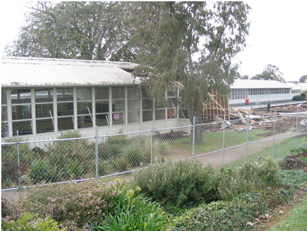
The 1954 buildings at Leongatha High being demolished in 2007