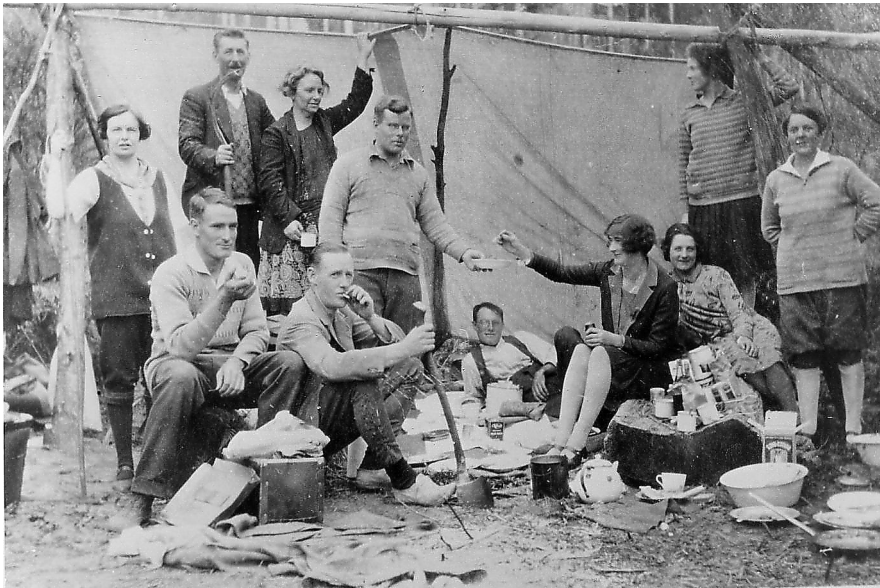
The staff on a picnic 1928/29