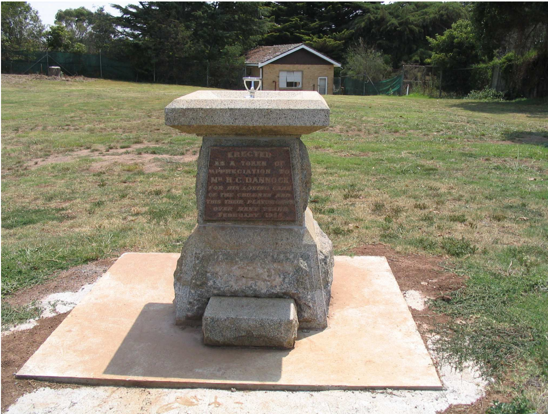
The Harry Dannock Memorial which is now located in the new park behind the swimming complex. In the background is the pump house from the old pool.