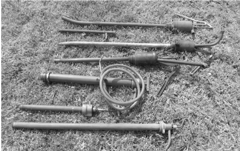
Fuel and oil pumps

During the 1950's an 800 gallon (1300) litres) underground tank was installed from which fuel was manually pumped into vehicles. Corrosion was a major problem with underground tanks and later farm fuel tanks were above ground so that fuel was transferred to vehicle tanks using gravity.