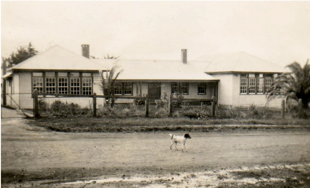
The newly rebuilt Leongatha High School in 1935. The dog is named "Spot"

This subject is popular with many. With the centenary of secondary education in Leongatha being only two years away, the history of schools will be important for some time. The Society plans to ask the schools in the area to prepare timelines on their school's history for display at the Mechanics' Institute.. Our October bus tour will take in some school sites and we will hear stories from former students of these schools