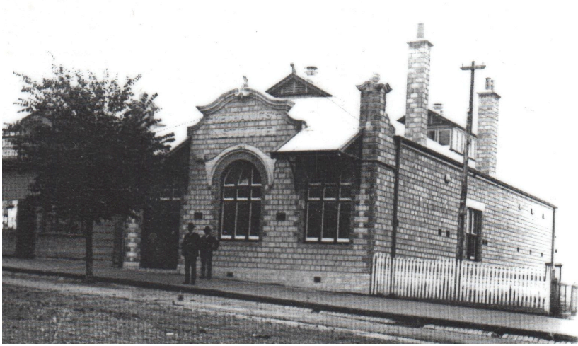
The Mechanics' Institute 1912