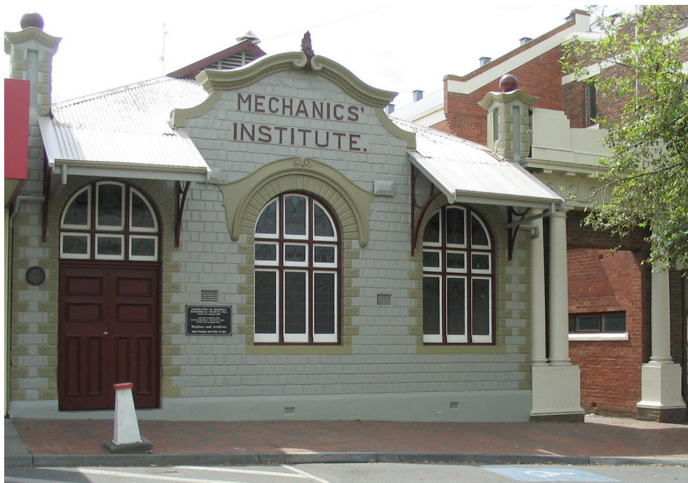
The Mechanics Institute October 30 th 2009. Awnings restored, good things happen to those who wait !