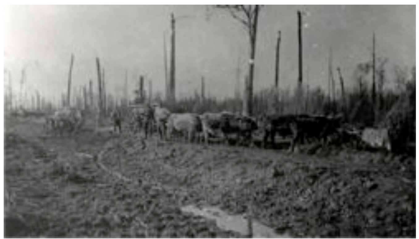
Road making in the pioneering days

We are attempting to keep the Historical Society open from Mondays to Fridays in January. Each day requires 2 volunteers. Pat Spinks is preparing a roster and is asking local members to commit to one day in January to assist our regulars in keeping the rooms open. At the same time we will be working towards the new display for Australia Day. Pat is hoping to have the roster organised by the end of year celebration so they can be distributed. Please contact Pat and volunteer (56686365)