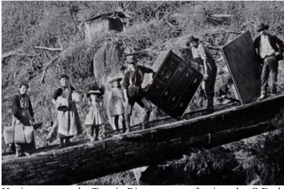
Having to cross the Tarwin River to move furniture by G Dodd