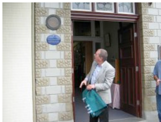
The Centenary Plaque