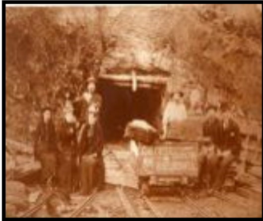
Coal Creek Proprietary Co. Mine