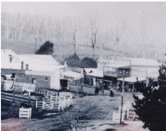
Roughead St c1900