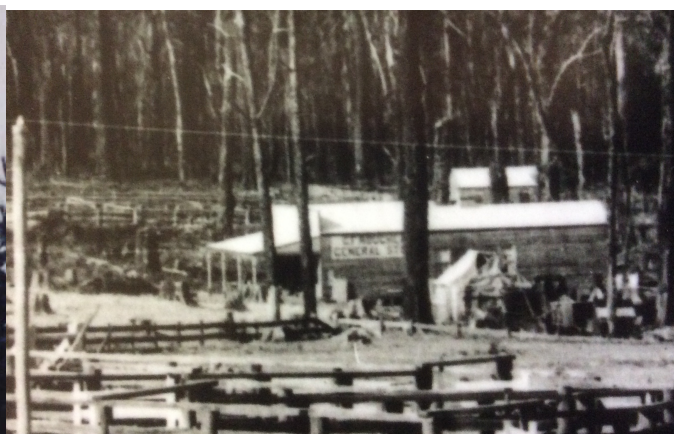
Roughead's Store c 1891

Early stores were located in Roughead and Long Streets and it seemed that the business area was to be near the railway. The hotels however located up the hill on the other side of the station and attracted other stores to Bair and McCartin Streets with those streets becoming and remaining the town centre. Other functions to locate in Bair and McCartin Streets were several banks, the Mechanics' Institute and the Shire Offices. The office of The Great Southern Star was also established in McCartin St on its current site.