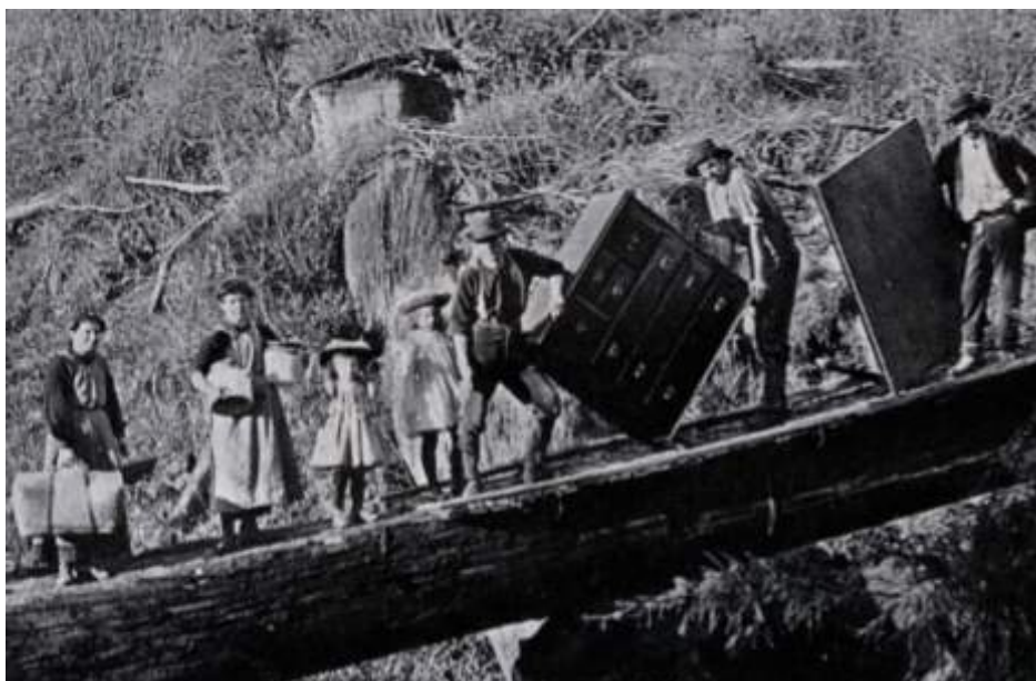
Having to cross the Tarwin River to move furniture by G Dodd