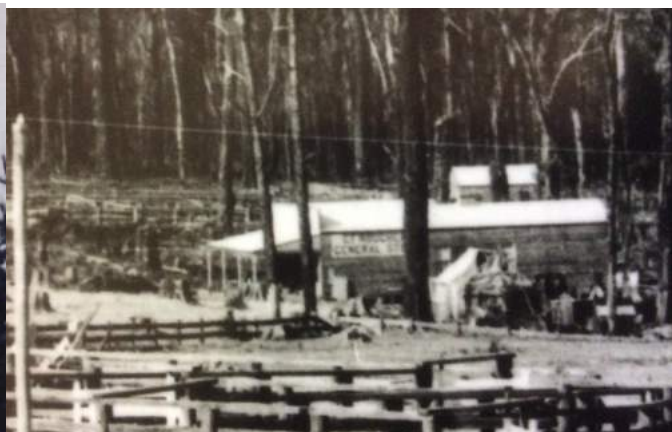
Roughead's Store c 1891

Early stores were located in Roughead and Long Streets and it seemed that the business area was to be near the railway. The hotels however located up the hill on the other side of the station and attracted other stores to Bair and McCartin Streets with those streets becoming and remaining the town centre. Other functions to locate in Bair and McCartin Streets were several banks, the Mechanics' Institute and the Shire Offices. The office of The Great Southern Star was also established in McCartin St on its current site.