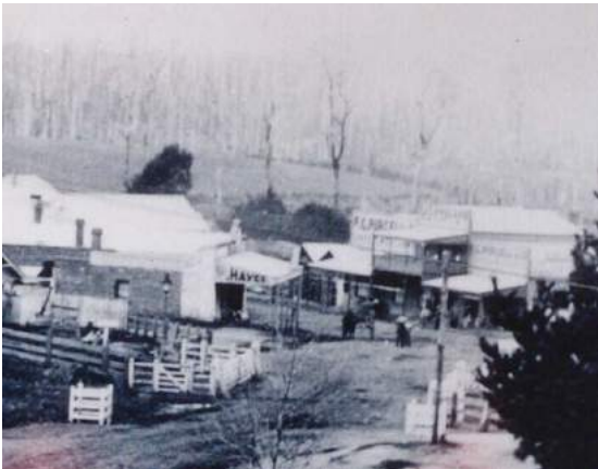
Roughead St c1900